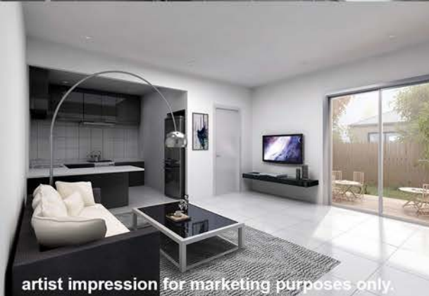
artist impression for marketing purposes only.